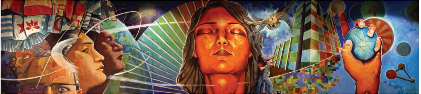
Transformation, a mural created for NorQuest by artist Ian Mulder, was inspired by student journeys of success.